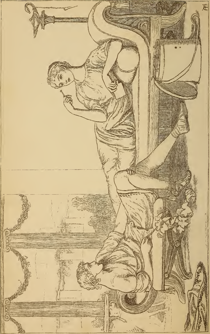
Aurelius and his Mother.